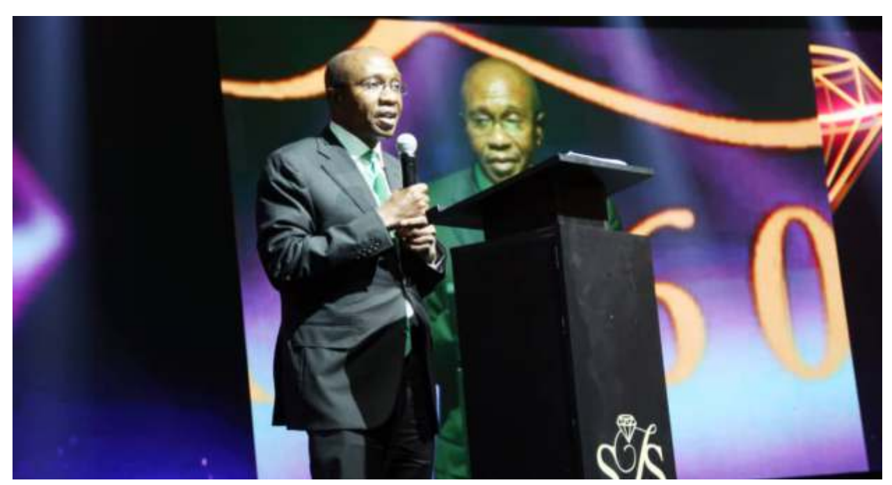
The Governor of Central Bank of Nigeria (CBN), Mr. Godwin Emefiele delivering an address at the 60th year celebration of Alhaji Sanusi Lamido Sanusi in Lagos.

consider stopping the practice of subsidizing power and fuel consumption in order to put the economy on a sustainable fiscal path. According to him, "Nigerians have to understand that the way we are going is not sustainable. We cannot continue subsidizing fuel and electricity. We have to be ready to make certain sacrifices."