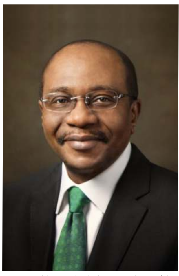
Governor of the Central Bank of Nigeria, Godwin Emefiele

Godwin Emefiele attained national and international limelight in 2014 when he was appointed as the Governor of Central Bank of Nigeria.